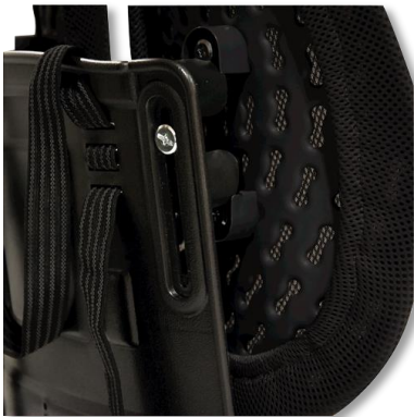
Height Adjustable 7 height settings for correct ergonomic positioning