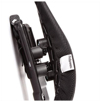
Wing Design Moulds to your back for ultimate comfort