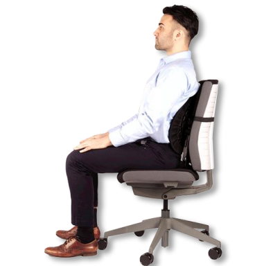
Ergonomic design Full back support to prevent back tension