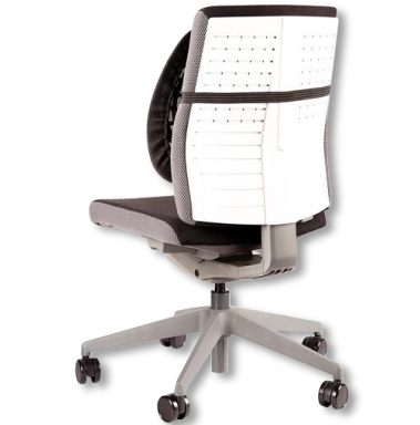
Easy to attach Fully adjustable elastic strap to fit most chairs